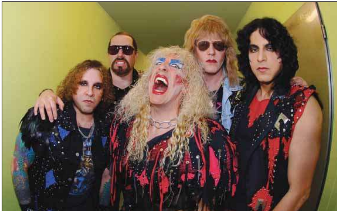
Twisted Sister will play at Rams Head Live on Thursday.