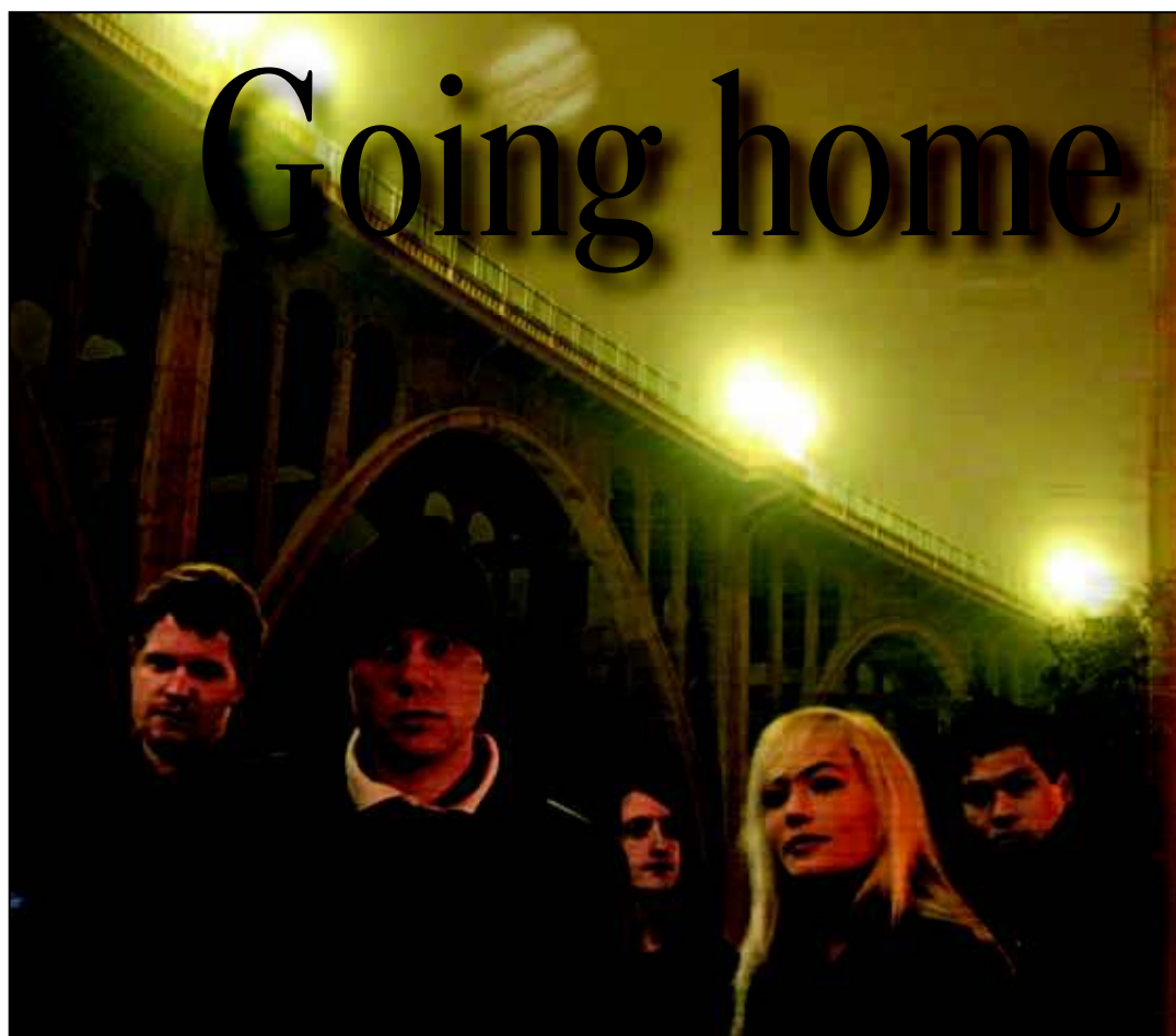
The Pasadena, Calif., band OZMA will play at Sonar in Baltimore on Saturday.