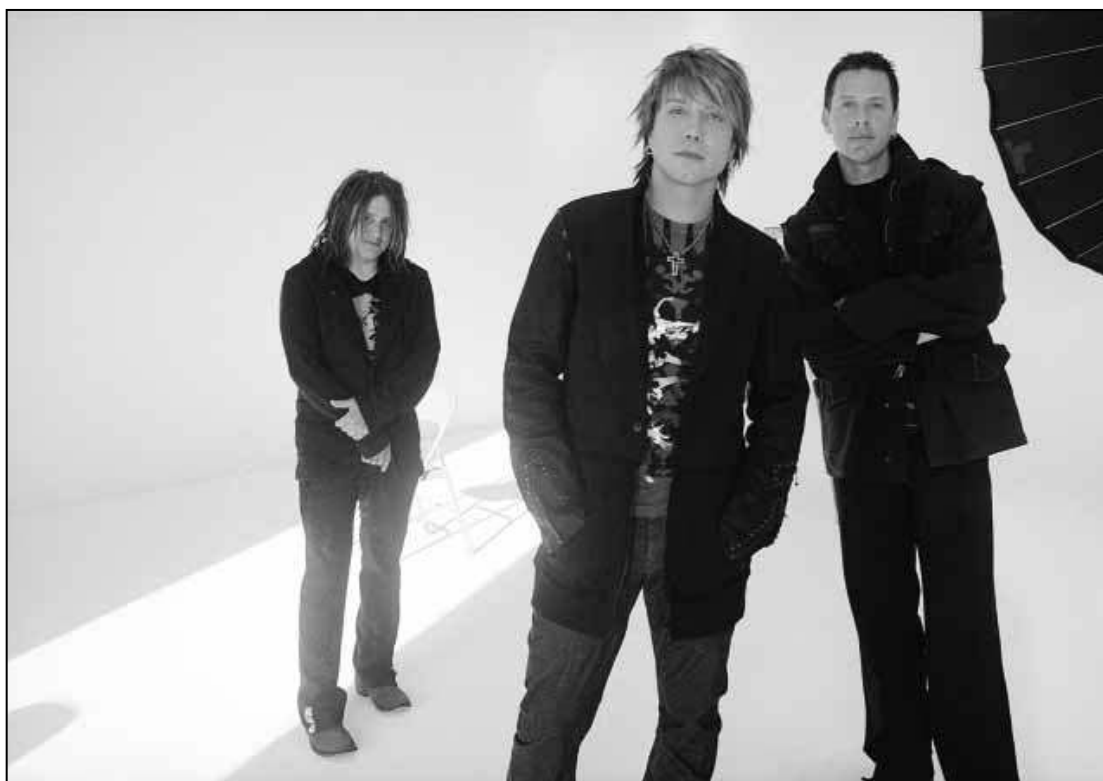
The Goo Goo Dolls (from left, Robby Takac, John Rzeznik and Mike Malinin) perform at the Lyric Opera House on Tuesday.